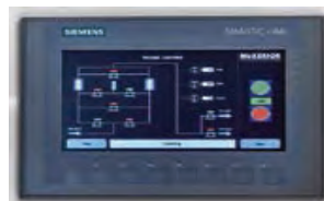
Siemens PLC Controller

Allows the monitoring / remote control of the main process parameters and displays status messages such as gas purity, flow rate, total gas flow, total functioning hours and maintenance alerts.