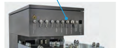
Instrumentation inputs and outputs

Allows the monitoring / remote control of the main process parameters and displays status messages such as gas purity, flow rate, total gas flow, total functioning hours and maintenance alerts.